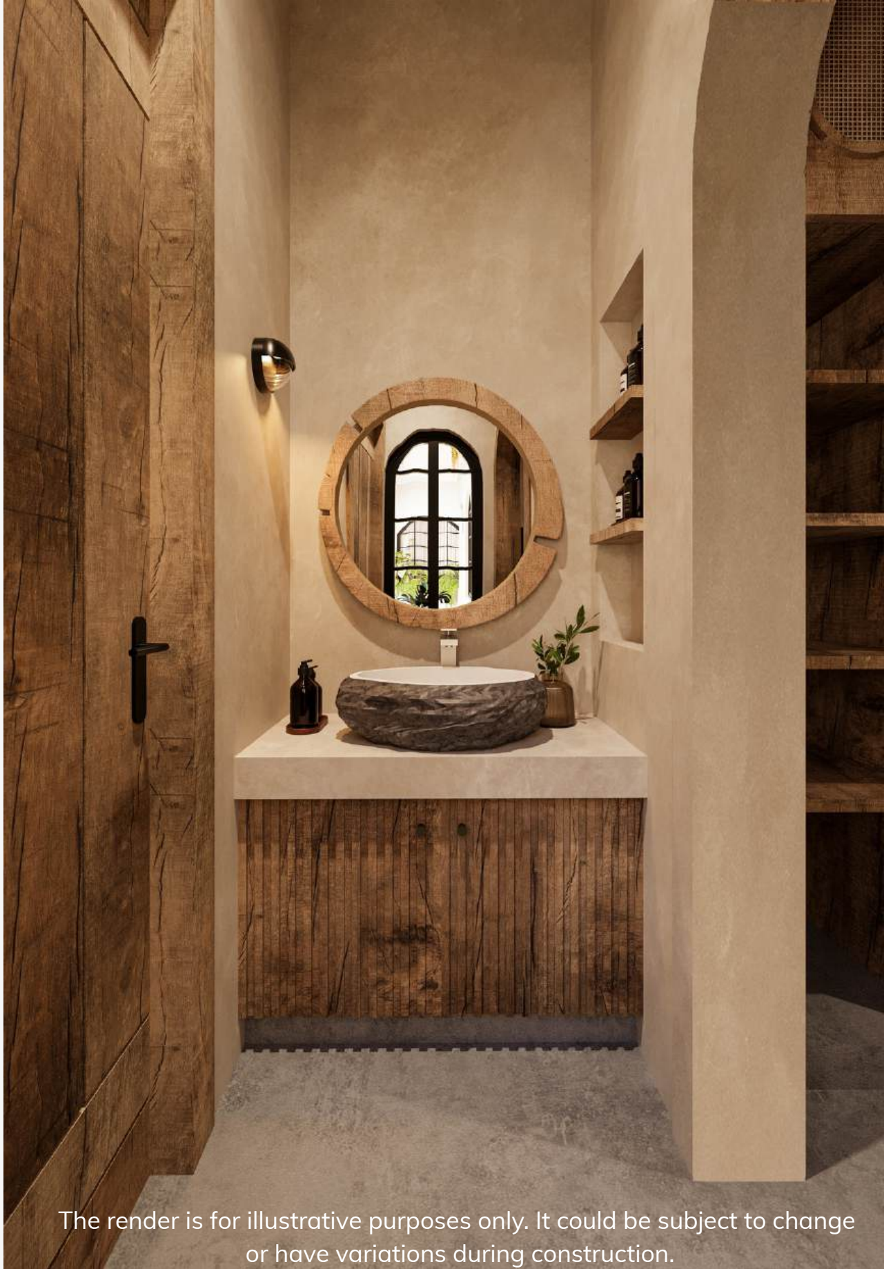
The render is for illustrative purposes only. It could be subject to change or have variations during construction.