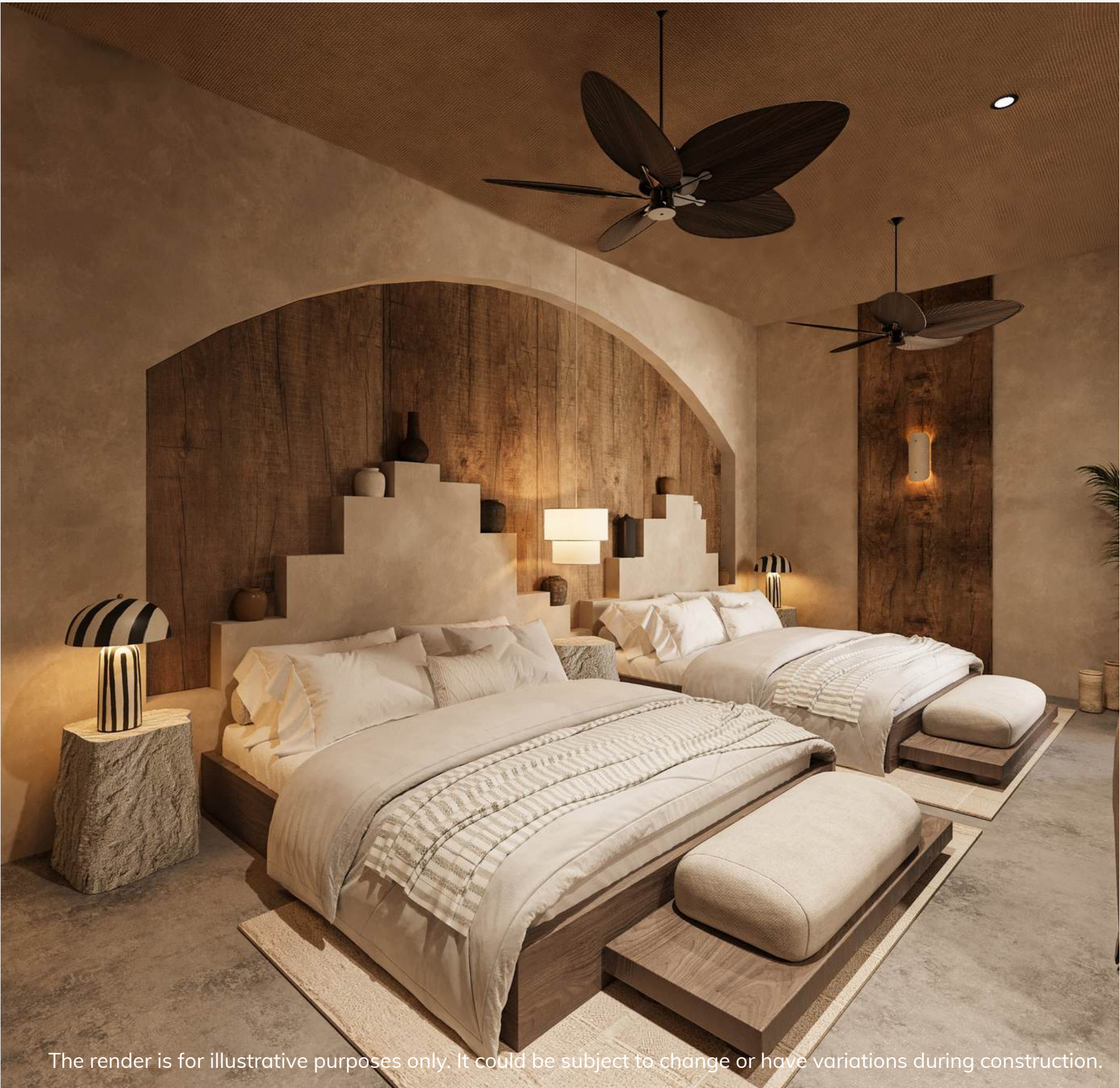
The render is for illustrative purposes only. It could be subject to change or have variations during construction.