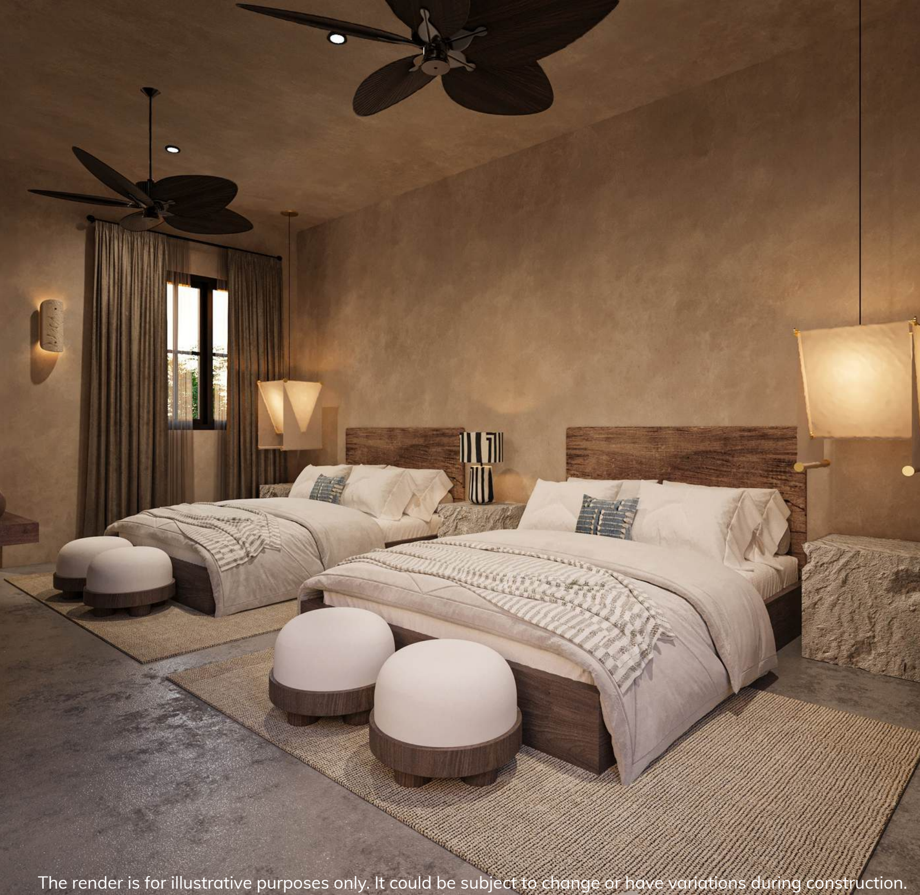
The render is for illustrative purposes only. It could be subject to change or have variations during construction.

The fifth bedroom features two queen-sized beds , offering both comfort and flexibility for guests traveling as a group or family. Designed with Satori Kanzo's signature aesthetic of natural textures, soft tonalities, and refined simplicity, the space feels grounded, spacious, and effortlessly elegant—perfect for shared moments without sacrificing tranquility.