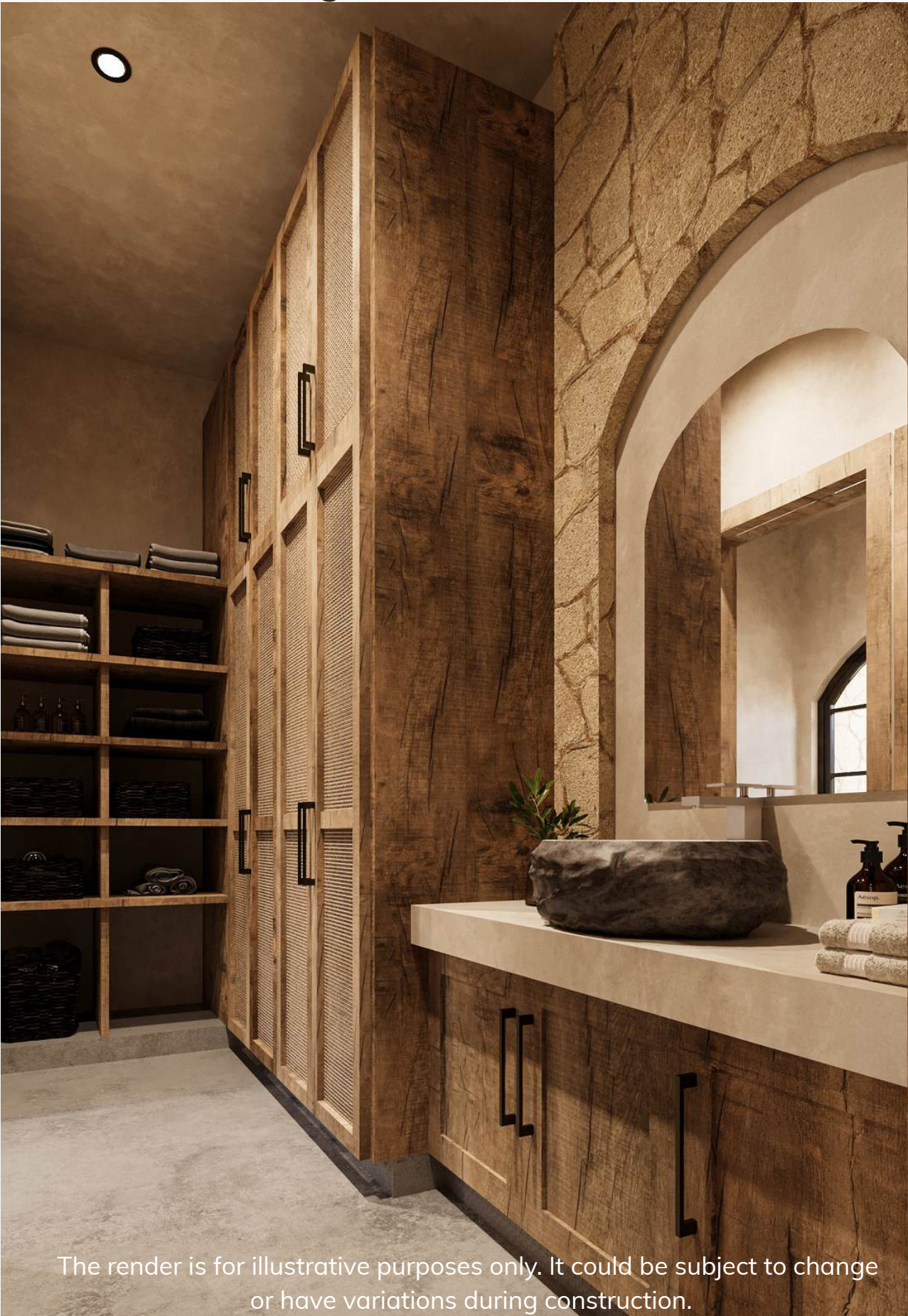
The render is for illustrative purposes only. It could be subject to change or have variations during construction.